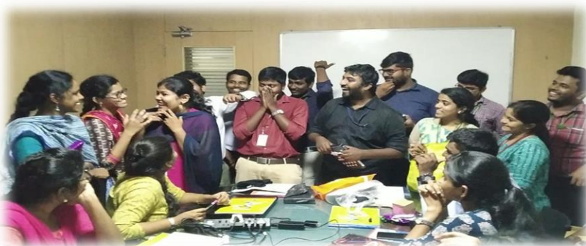
The joy of sharing and Thanks Giving 2019