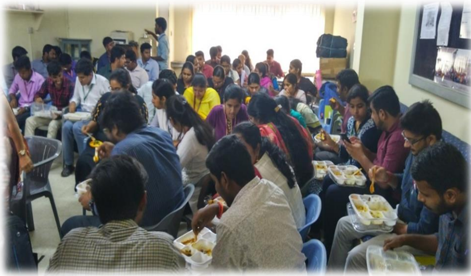
Students enjoying food after the first session