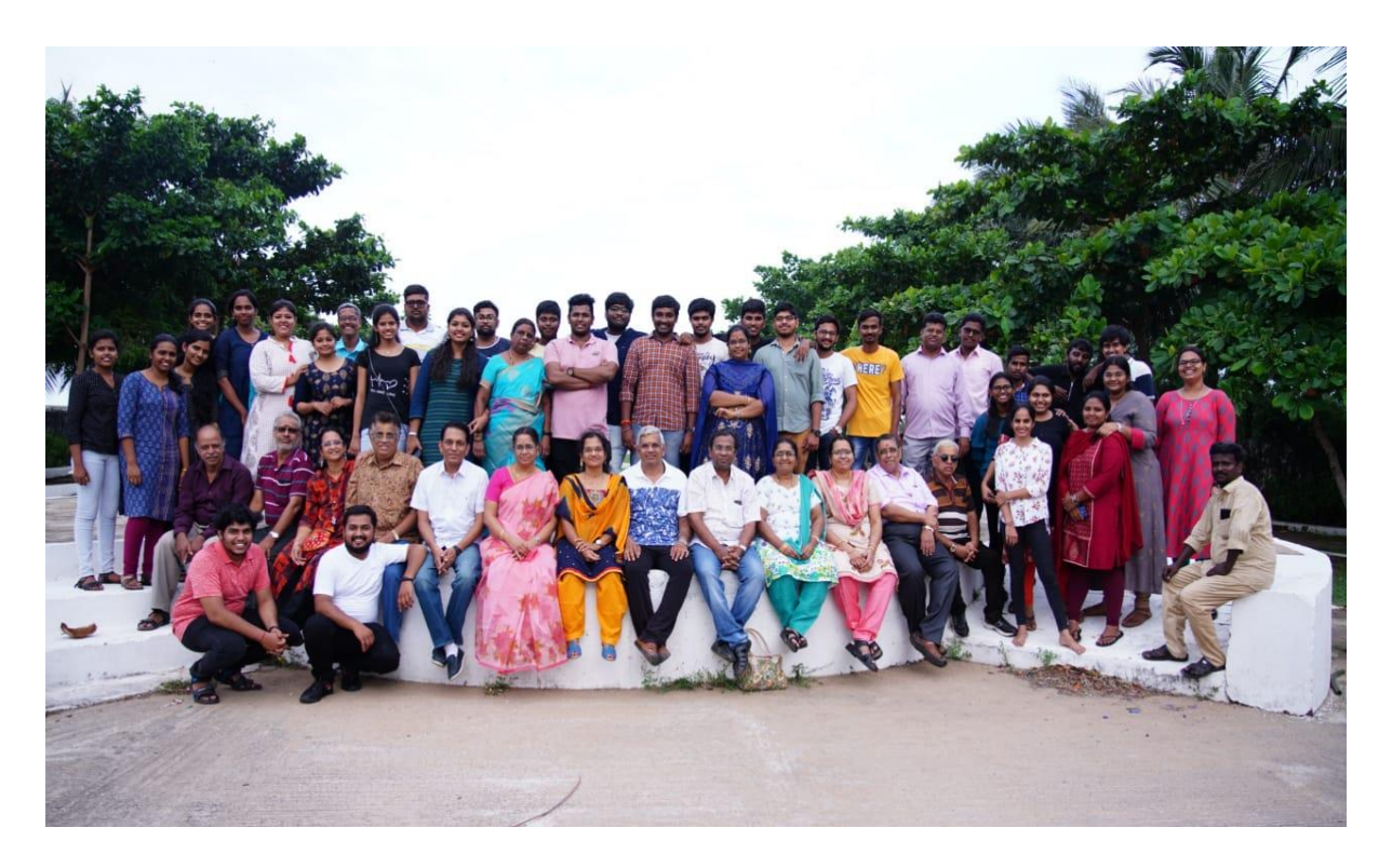
TEAM SA GROUP PHOTO WITH BEACH BACKGROUND